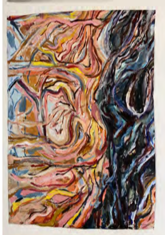
Fragments – The First Mile is the Hardest (portrait of mom), 2020, acrylic on canvas, overall dimensions variable, each segment 53 x 71"