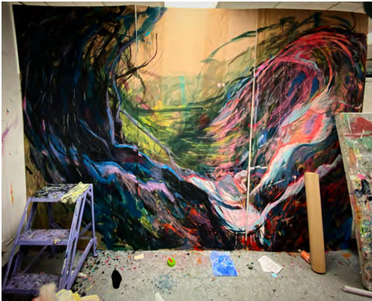
Acoustic Energy Distribution of Chorus Howls , 2020, mixed media on panel (installation view), 108 x 156"

Nice to Meet You, Madame President: Archive from the Dead Baby Club 2012-2019 , detail, 2020, mixed media, dimensions variable, originally conceived as an 8'x4'x4' cubical one could step into to explore each item within the archive.