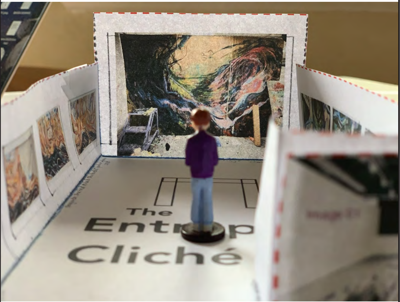
Paper Gallery (installation view), 2020, collage and digital print, 8.5x11"